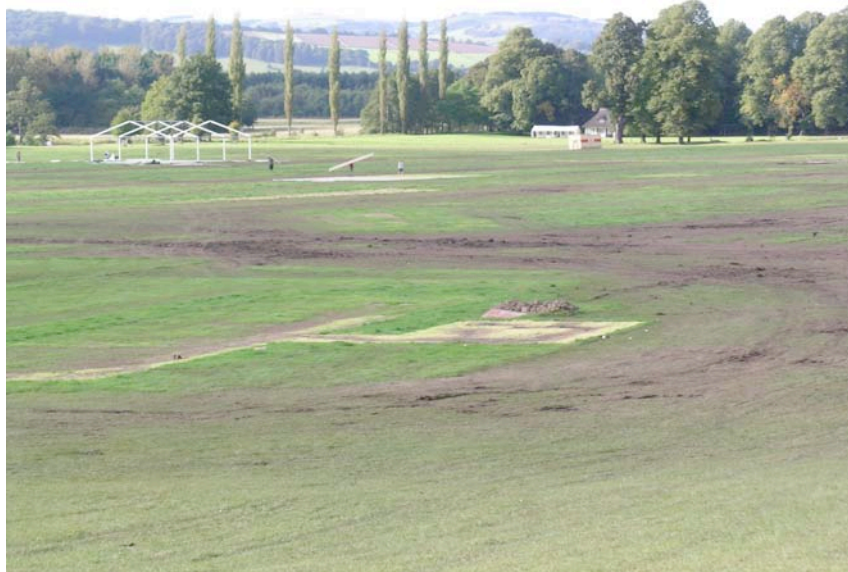
Chatsworth, post Country Fair