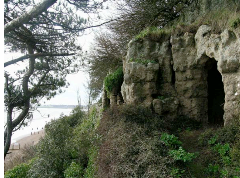
Bawdsey Manor, Suffolk