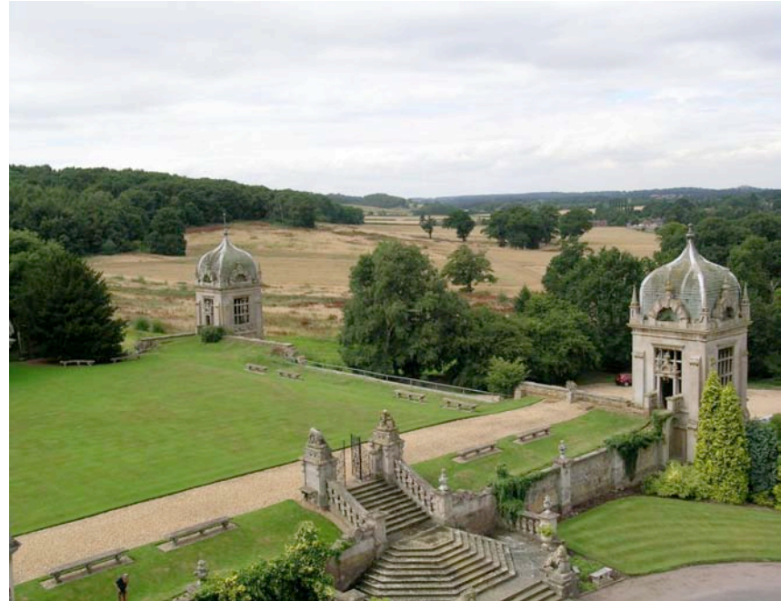
Harlaxton Park, Lincs