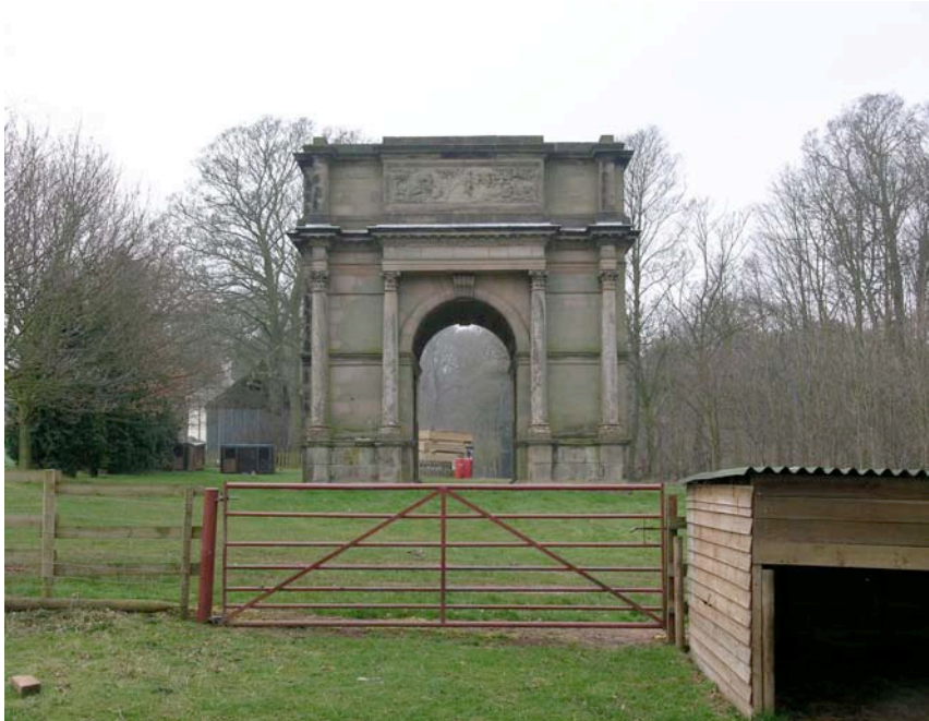
Multiple ownership: Garendon Park, Leics