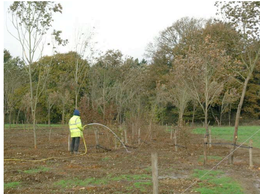
Luton Hoo, Beds new golf course