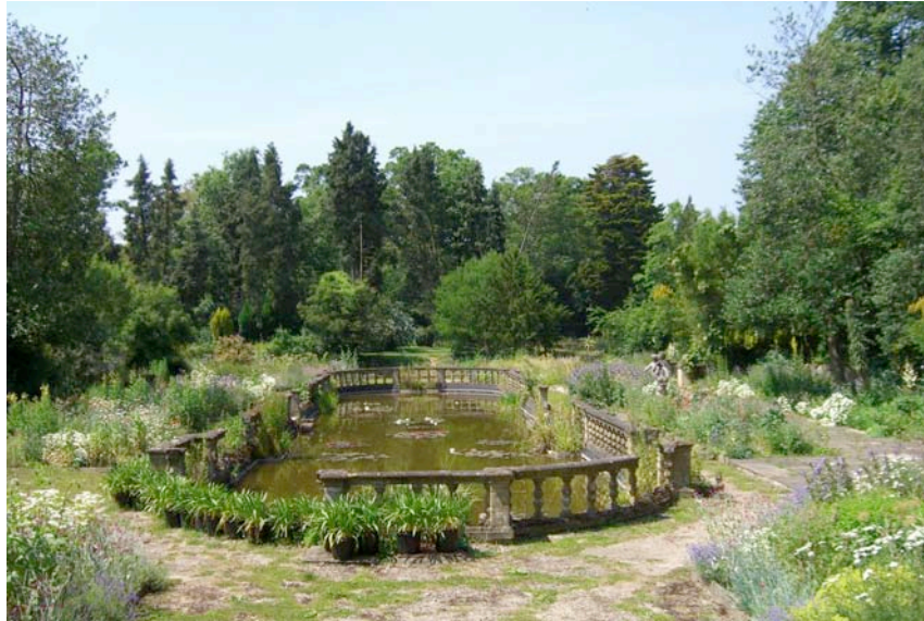
Easton Lodge, Essex